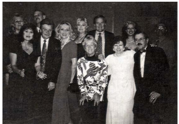
SSC's contingent at the 1995 Snow Gala