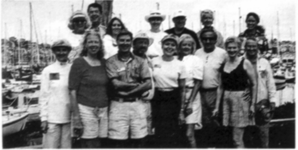
SSC delegates to the FWSA Convention in San Diego