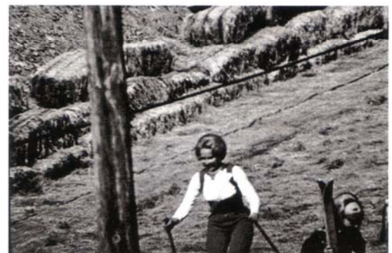
Believe it or not, the contest was held at Mt. Baldy and the girls had to ski on straw as part of the competition!