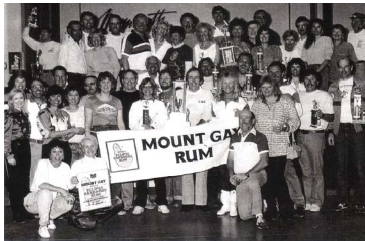
1988 L.A. Council Championships - SSC is No. 1