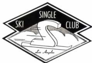
New logo thru 1970