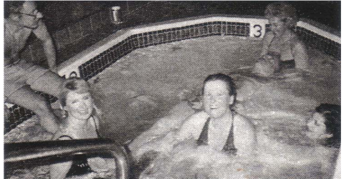
Jacuzzi'ing never goes out of style