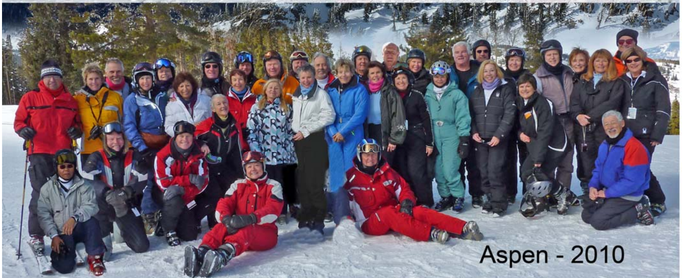
Aspen - 2010