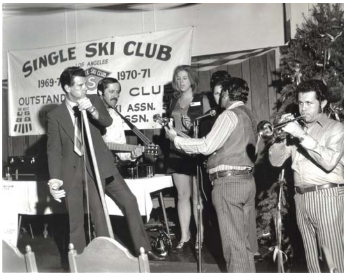
Wilshire Boulevard Buffalo Hunters from the Moonshiners Cave, Aspen, performing at the Blarney Castle

In April 1970, SSC purchased 22,000 square feet of Mammoth property for the astounding price of $14,500 with an $8,000 down payment. By November, 1973, it was completely paid for. The idea was we would build a ski lodge. However, over the years controversy arose from some folks who felt we should sell the property and use the proceeds to defray administrative costs.