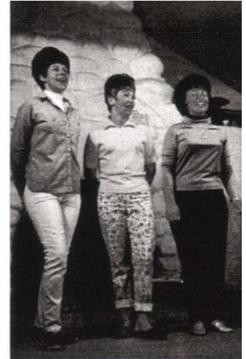
"The Famous Dung Sisters"