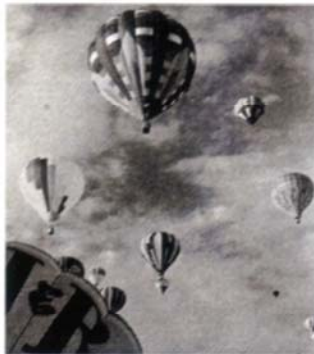
In my beautiful balloon ...