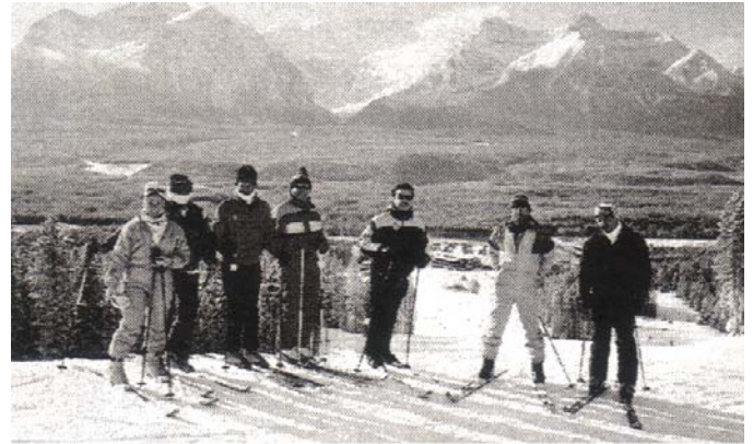
The view from Lake Louise

Jeff's Note: If you feel left out because your cases of moral depravity have been omitted from the report, be sure to squeal on yourself next year.