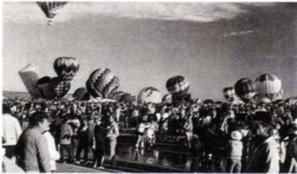
Up, up and away!