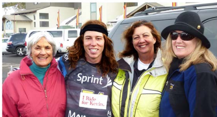
Shaun White and Past Presidents