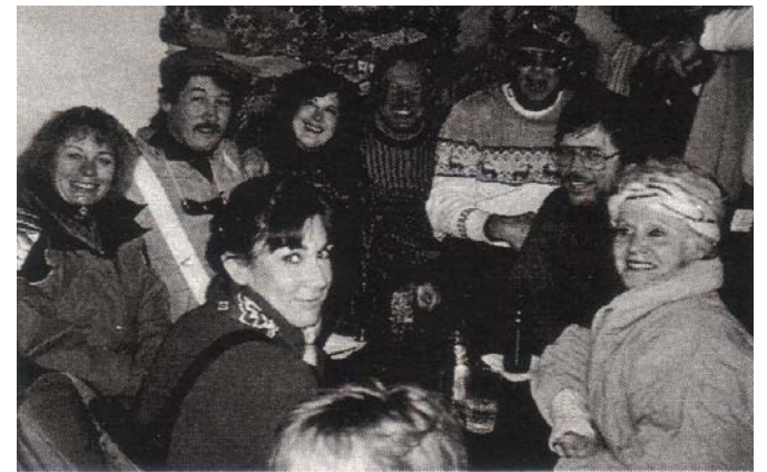
Good ski buddies