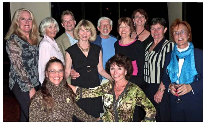
SINGLE SKI CLUB 2010-2011 BOARD OF DIRECTORS