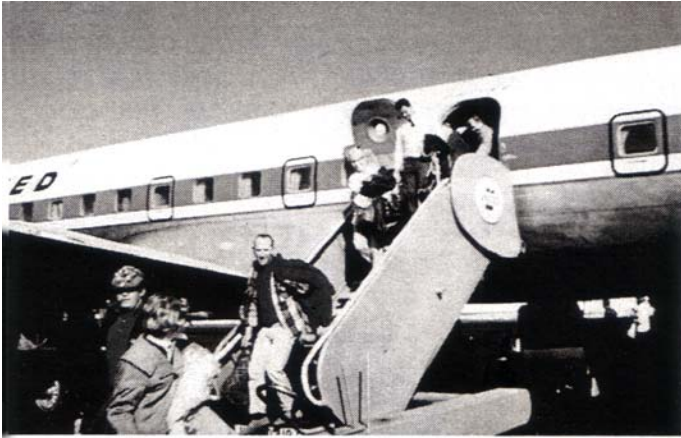
Aspen Trip - 1968(?) - Ed Rice and Mike Szotyk and others

just $165 in '64. Several ski areas were available: Ajax, Aspen Highlands, Snowmass and Buttermilk with a side trip to Vail. Before departure there would be a pre-Aspen get-acquainted party so everyone would know each other.