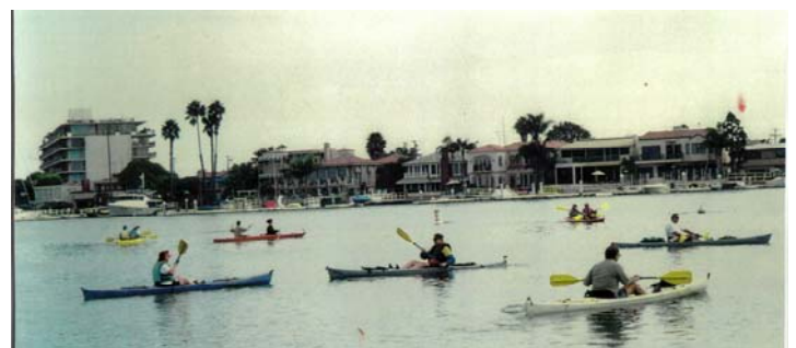
Kayaking – a new sport for SSC