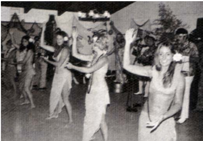
First the girls do the hula. . .