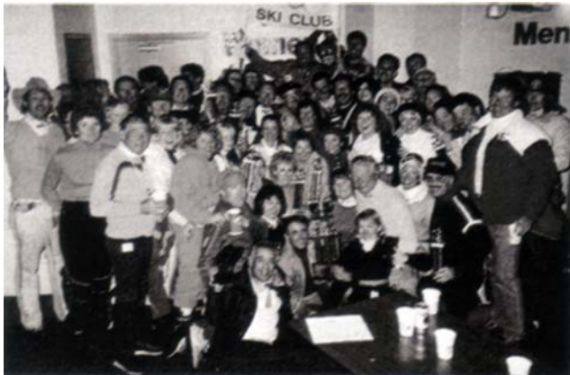
A winning Rokka Team