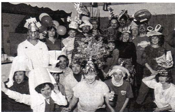
Hat contest on New Year's 1987-88 Mammoth trip