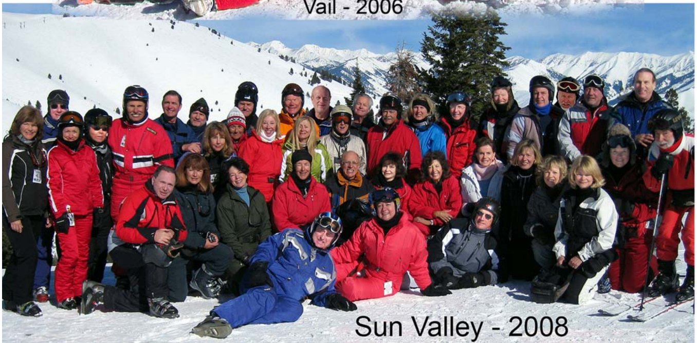
Sun Valley - 2008