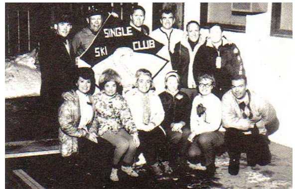
Single Ski Club "Convention" in Aspen, 1965

In 1962, several brave and enthusiastic SSC skiers boarded a bus for a ski holiday at Aspen, hailed as the ski capitol of the world. It was a grueling 36-hour trip, but while at Aspen they temporarily forgot about that ordeal due to the tremendous skiing the area provided. After their return, it was obvious they had to do it again, but a 36-hour bus trip was out of the question. Not discouraged, they came up with a plan: fly to Grand Junction and go by bus from there. The Aspen airport at that time would not accommodate any plane of the size required. Our planes got bigger and bigger; by 1970 we carried 99 passengers. As usual, there were liquid refreshments on board the plane and the bus. The price included transportation, lodging, lessons, lift tickets, breakfast, banquet, races, and hot buttered rum parties. You got all this for