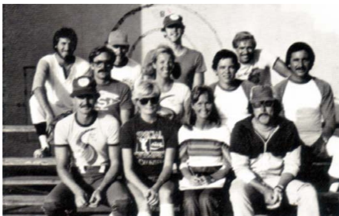
The Line Drivers