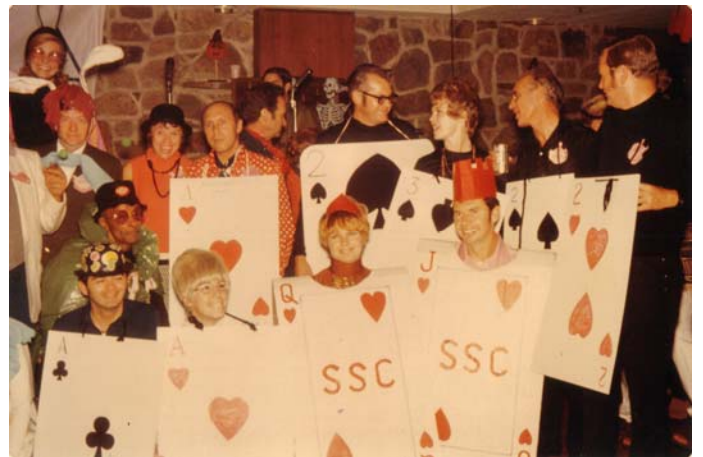
1970 Southern (LA) Council Sno-Ball

In November '71, SSC had a second-place showing at the Southern (LA) Council Sno-Ball with a first place for table decorations and second place for group costumes. SSC's theme was "Great Lovers of the Silver Screen". Table decorations were a huge movie camera on a tripod and a 4' golden Oscar. We weren't as successful in 1974 with the "Circus" theme although some individuals won prizes.