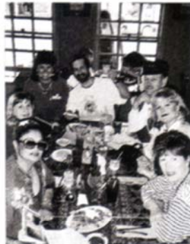
A Mexican feast ...