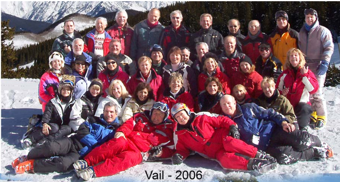
Vail - 2006