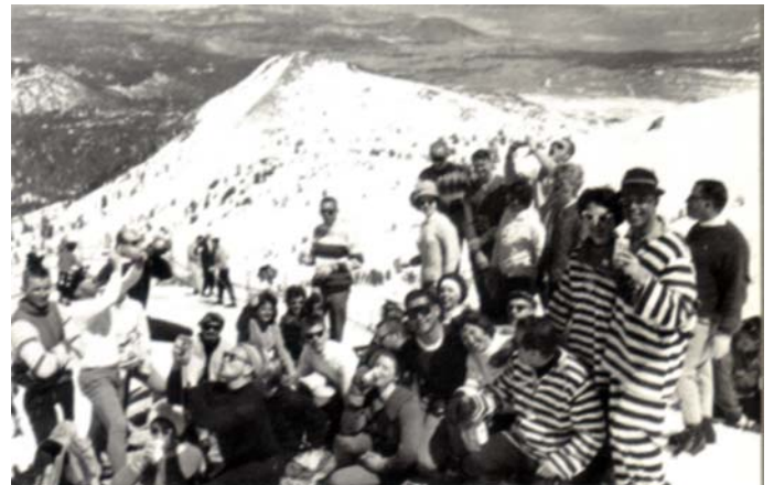
SSC parties at the top of Chair 3, shown in Time , May '63