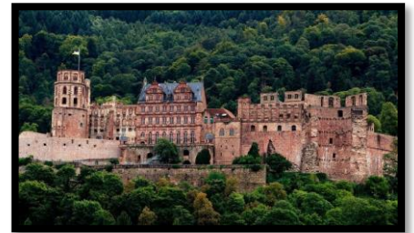
Enjoy Regional Cuisine