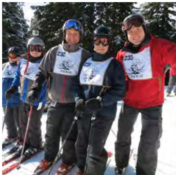
PACRAT Racers at the Top of the Course

And speaking of conventions, NWSCC is excited to be hosting the 2014 in fabulous Bend, Oregon, at the Riverhouse Hotel and Conference Center. Mt. Bachelor and lots of microbrews await. We all know where you're gonna go when the Volcano blows!!