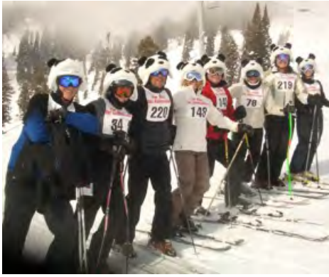
The Tahoe Donner Senior Alpine Ski Club Fighting Pandas pose after their Council Challenge race at Jackson Hole.