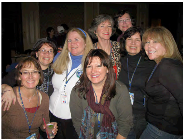
NWSCC Girls at FWSA Ski Week