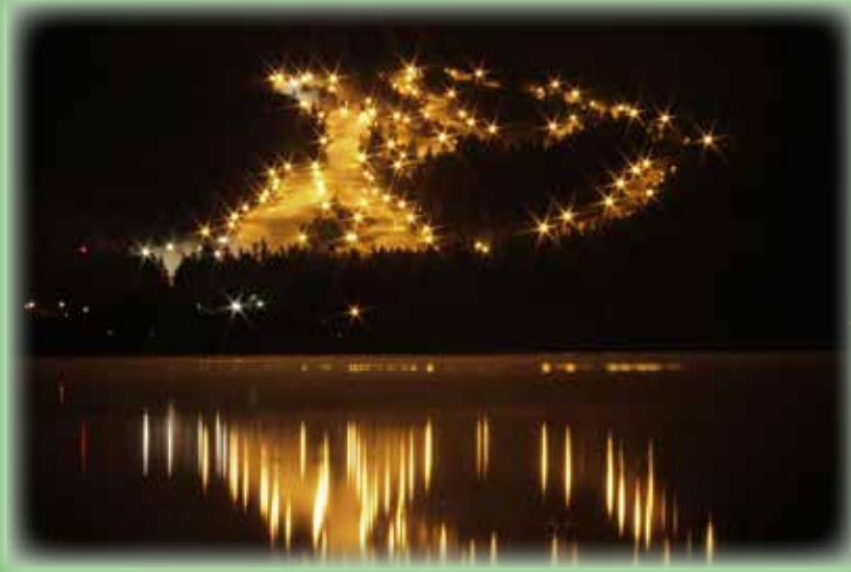
Spectacular torchlight parade closes out the year at Snow Summit, Big Bear Resortx

6:30. If you are interested in joining the club, come to one of our meetings to sign up! https://www.meetup.com/SnowDrifters/