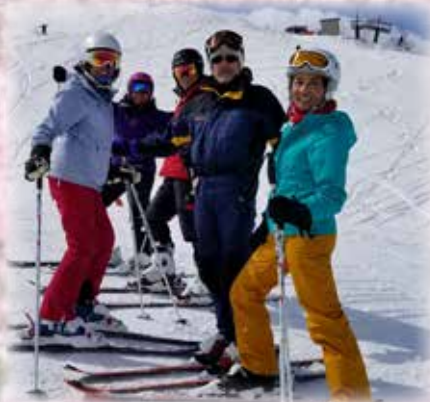
Nisei Ski Club at Goryu47-Hakuba