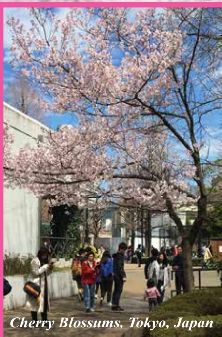
Cherry Blossoms, Tokyo, Japan