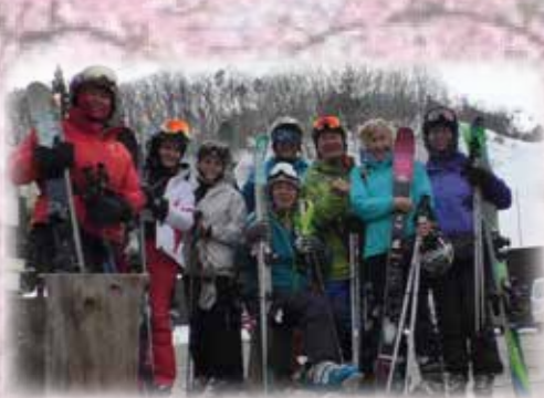
End of the Day