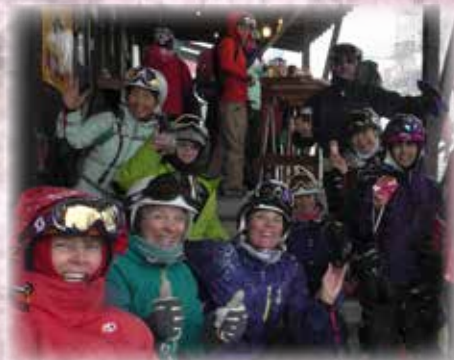
End of Day - Group 3