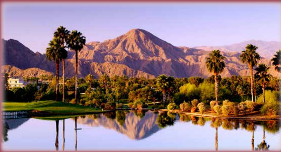
Greater Palm Springs area