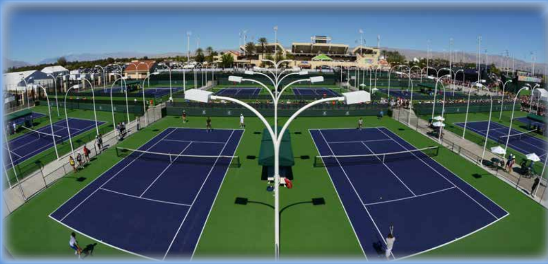
Indian Wells' Tennis Gardens, site of the 2019 BNP Paribas Open