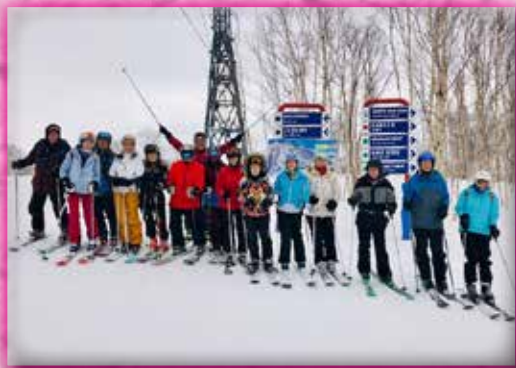
Group Photo in Niseko, Japan