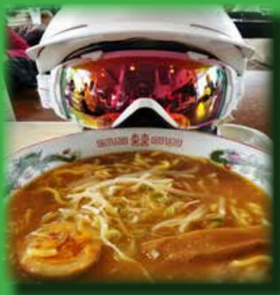
Enjoying ramen at Happo Ski Resort in Hakuba Valley, Japan

Samurai Warriors. While touring the Samurai historical district, we learned that they were the guardians of the Emperor.