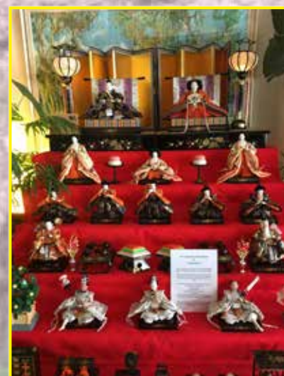
Japanese Doll Festival Exhibit