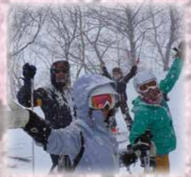
Skiing Freshies in Hakuba