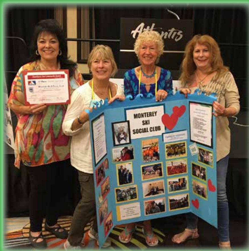
Monterey Ski & Social Club of Bay Area Snow Sports Council was 2018 winner of “Charities & Our Community” Recognition in Double Diamond Class.