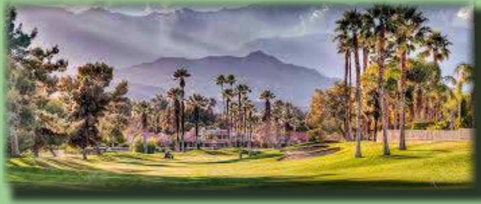
Indian Wells, California