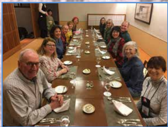
Dinner at the Tokyu Hotel in the Tatami Room