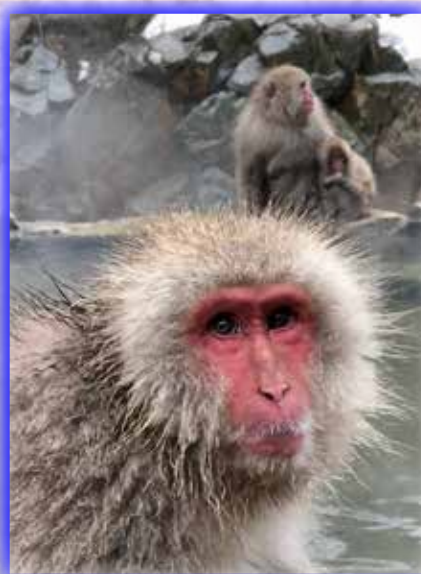
Snow Monkey Park