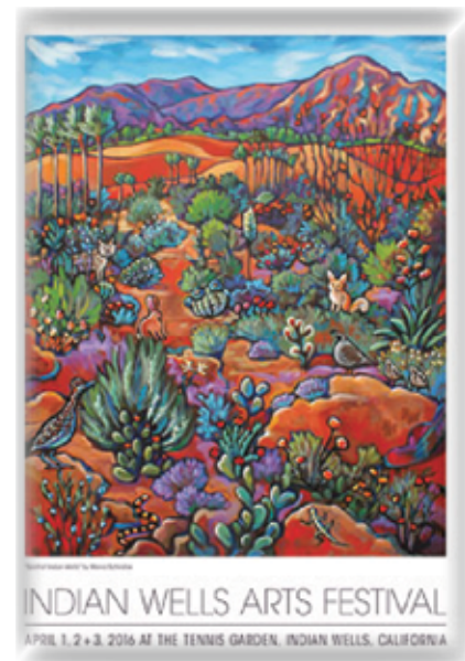
"Spirit of Indian Wells" by

have been and currently are members of the Bay Area Snow Sports Council and Far West Ski Association Board of Directors that continue to make BAC a thriving and successful Council.