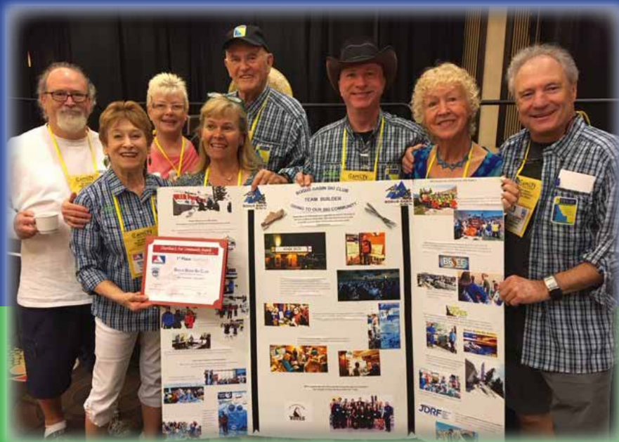
Bogus Basin Ski Club of Intermountain Ski Council was 2018 winner of “Charities & Our Community” Recognition in Diamond Class.