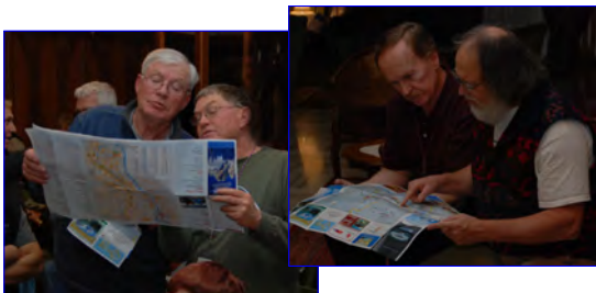
So many trails, so little time