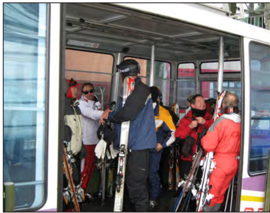
Up to the slopes via gondola