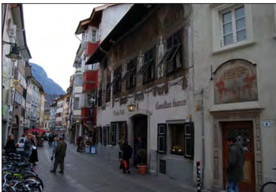
The Cortina Village was charming