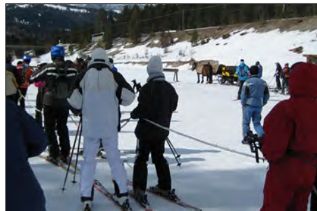
Whatever you do, don't let go of the rope!