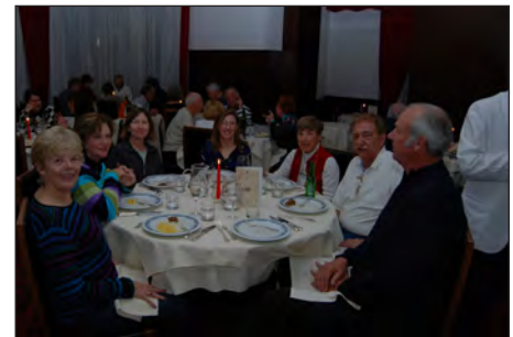
We dined in style, loved the desserts