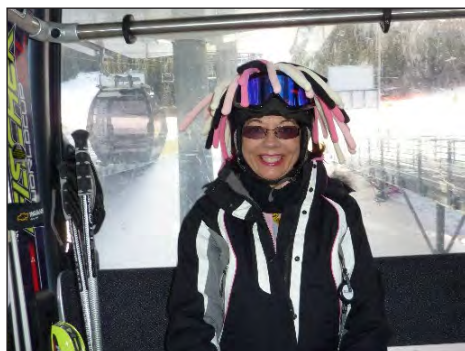
There's always one in the crowd