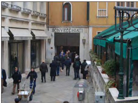
Hotel Bonveccchiati had a great location