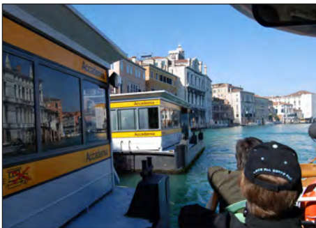
Water taxi to the airport. It was great!!