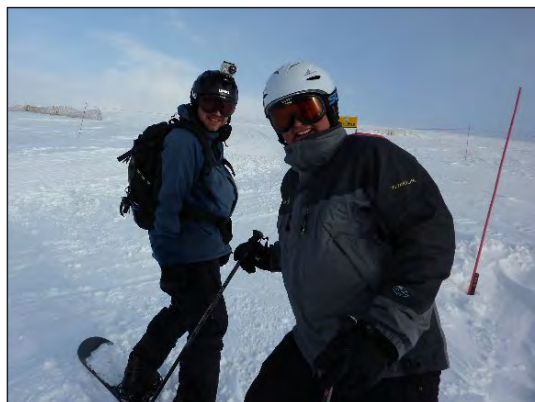
Sometimes skiing is magical