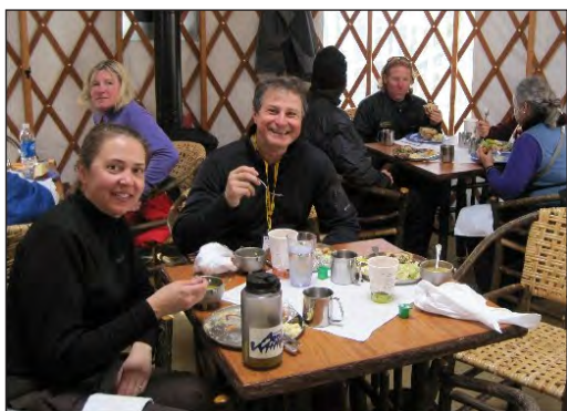
Enjoyed a great luncheon together