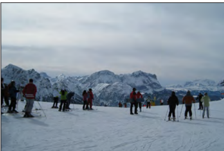
The mountains and slopes were awesome