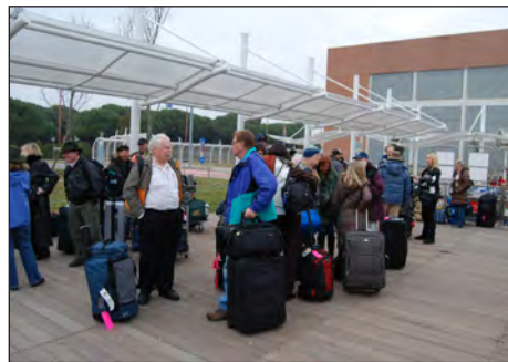
Goodbye Venice, off to Cortina