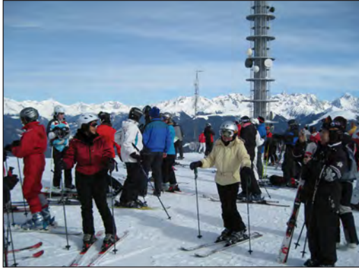
Feels like the top of the world