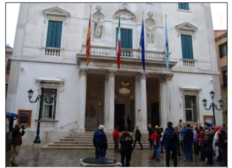
The restaurant location is where?