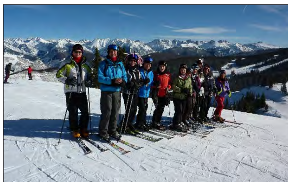
How about that background for the skiers