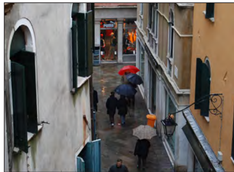
Only rained the first day