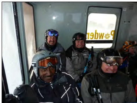
Vail Resorts donation of 20 Snow Cat Skiing spots was enjoyed by all