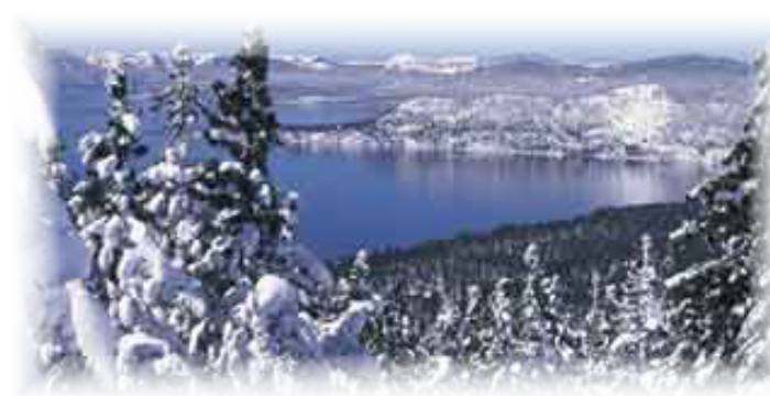
Beautiful Lake Tahoe, California