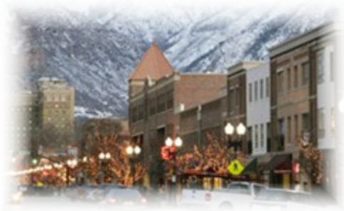
Hampton Inn, Ogden, Utah