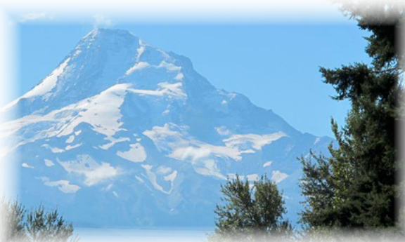
Mt. Hood as seen from the Japanese Tea Gardens

board has done a terrific job addition to our usual slate of annual "PACRAT/NASTAR all ages to participate in our Ski Bowl provided support