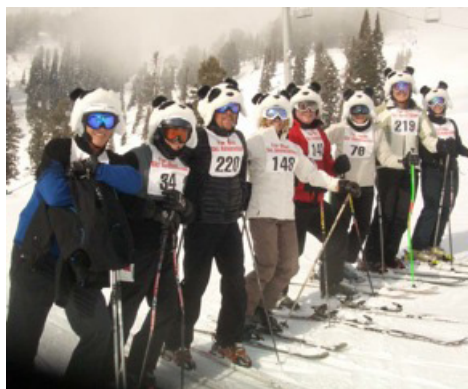
The Tahoe Donner Senior Alpine Ski Club Fighting Pandas pose after their Council Challenge race at Jackson Hole.

As we head into the spring, our council and member clubs are preparing to hold elections and planning summer activities.