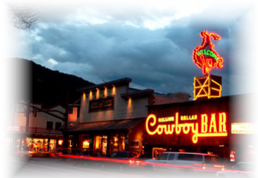
Million Dollar Cowboy Bar