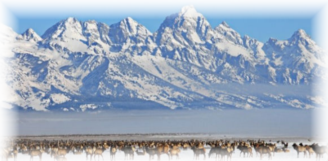
National Elk Refuge, Jackson, WY