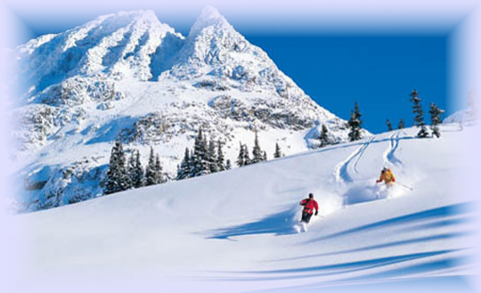
Skiing Aspen Snowmass

The four mountains await our presence. The Aspen/Snowmass flier is on the fwsa.org website. If you are interested in participating in the 2013 ski week in Aspen/Snowmass, you can sign up with one of the Council Trip Leaders listed on the flyer.