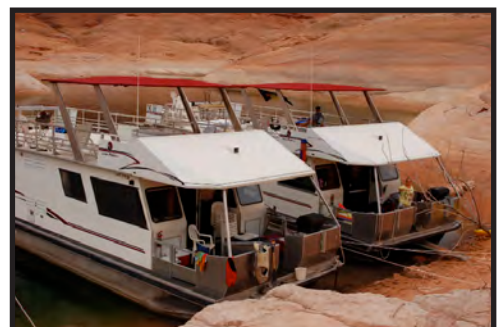
Docked for the Day