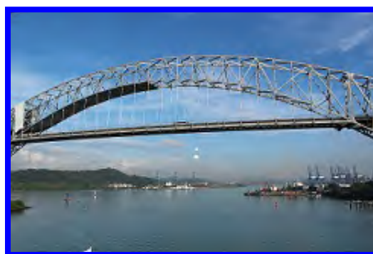
Bridge of the Americas between North and South America