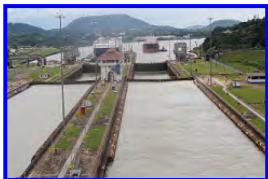
Locks at the Panama Canal