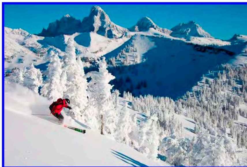
Grand Targhee, Wyoming