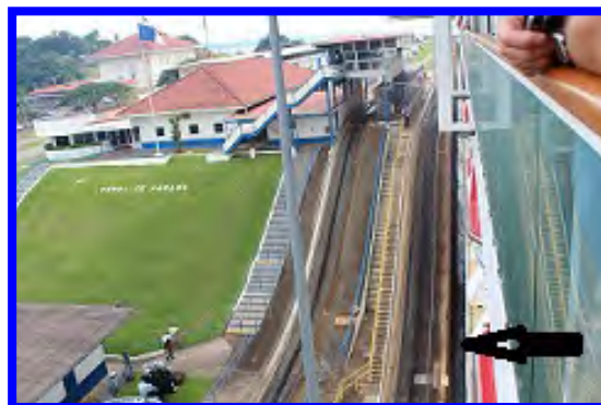
The black arrow shows the space between the ship and the concrete in the canal