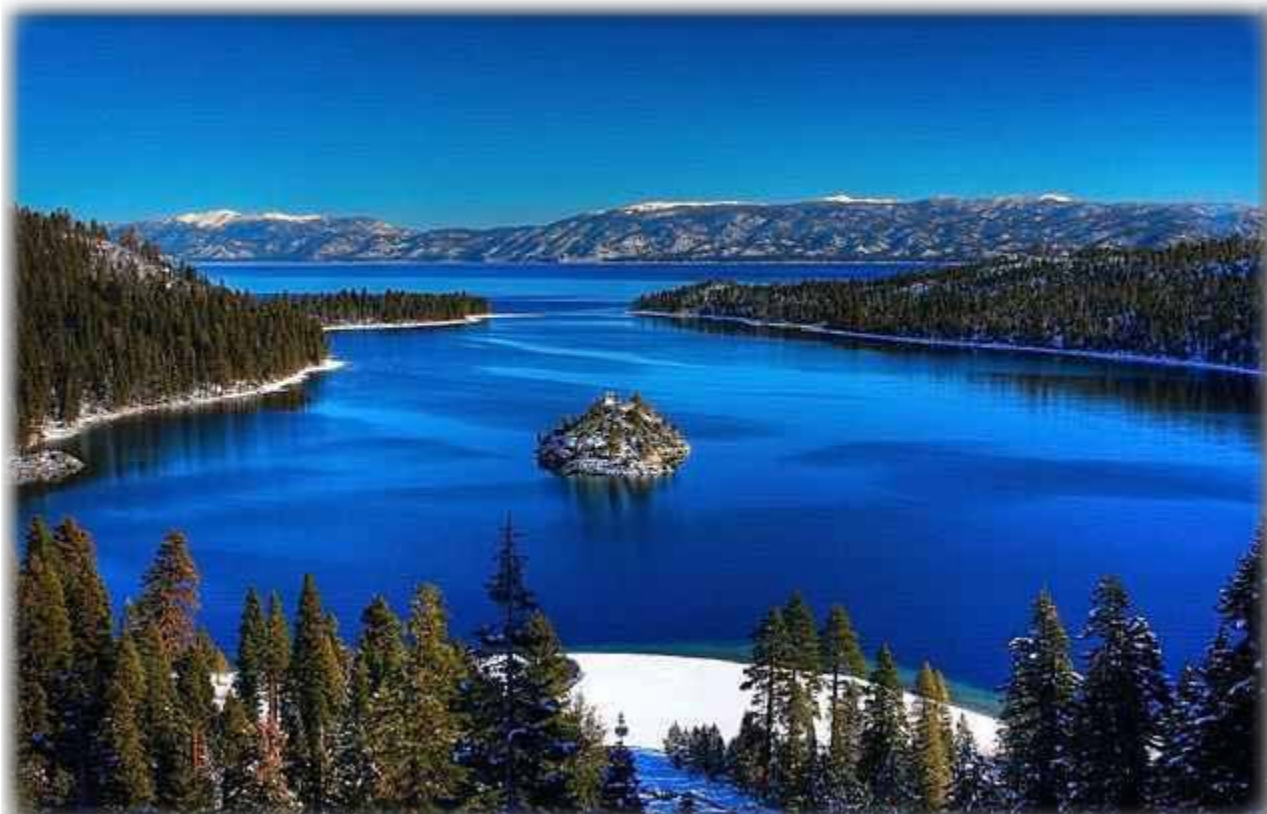
Beautiful Emerald Bay at Lake Tahoe

Delegates are welcome to attend all events unless otherwise indicated. Participation in Travel Expo is encouraged for all club trip planners and board members. A Travel Expo Prize will be awarded only among those who participate. Other prizes will be awarded among all registered Convention delegates.