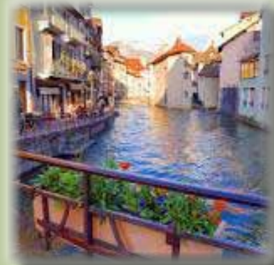
City of Annecy