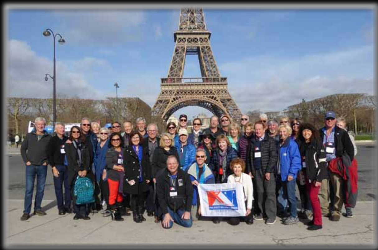
Group at Eiffel Tower