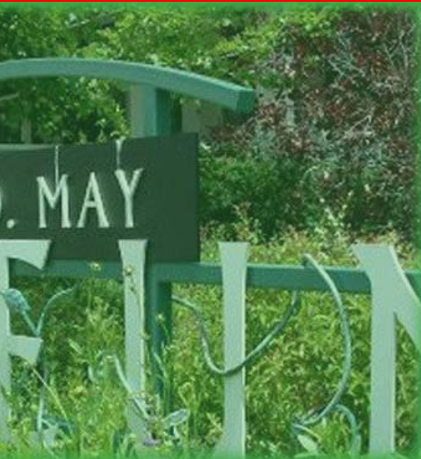
Wilbur D. May Museum at Rancho San Rafael Regional Park