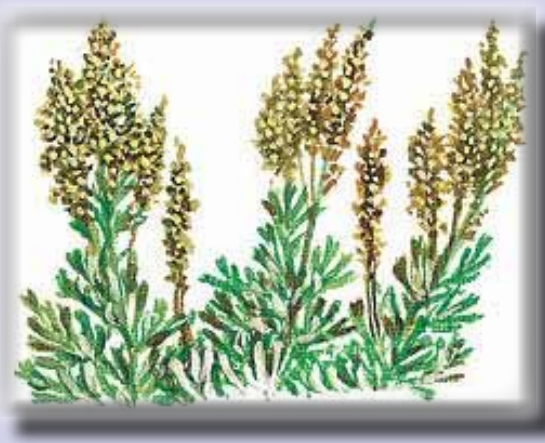
Sagebrush - State flower of Nevada