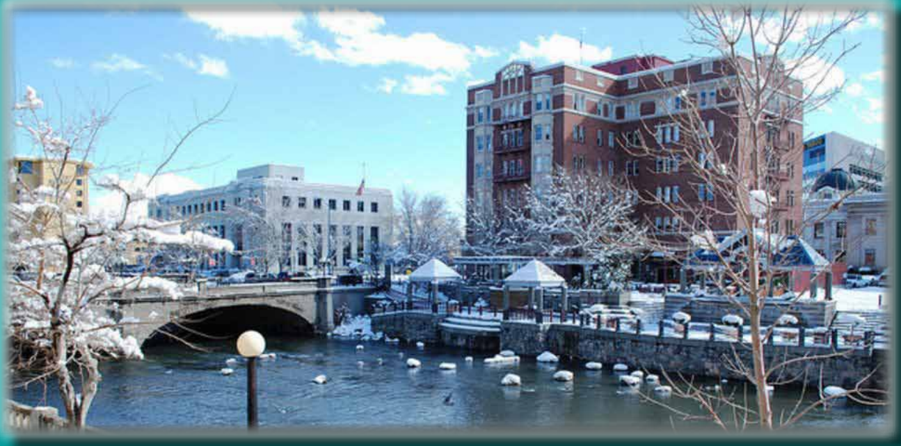
The Riverwalk District--Reno's New Downown