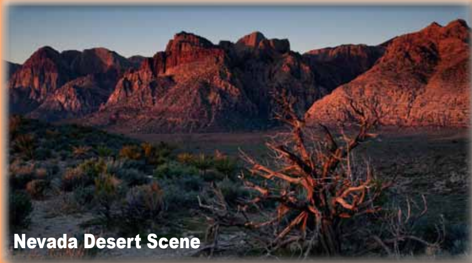
Nevada Desert Scene