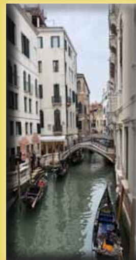
Canal in Venice