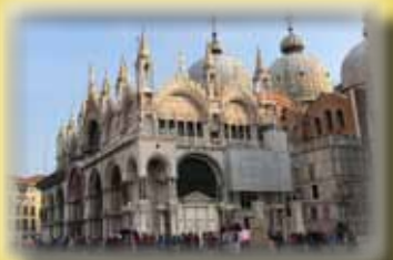
Basilica di San Marco in Piazza San Marco, Venice