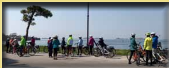
Bicycle tour on the Island of Lido. Venice in the distance

We boarded “Ave Maria” in Venice on Saturday, March 24 with a guided walking tour of this beautiful and historic city the next day. Our week long journey would take us along the Po River, arriving in Mantova on March 31. Our bike rides ranged from 25 to 40 km each day. This tour was mainly flat so even novice cyclists would not feel overwhelmed. Some of us had e-bikes which are an advantage on hills or if it is windy. Our weather was exceptionally good for March.