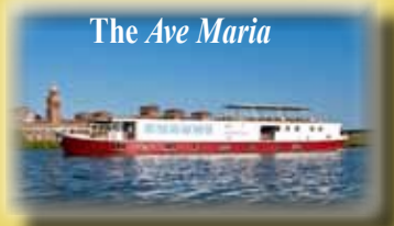
The Ave Maria