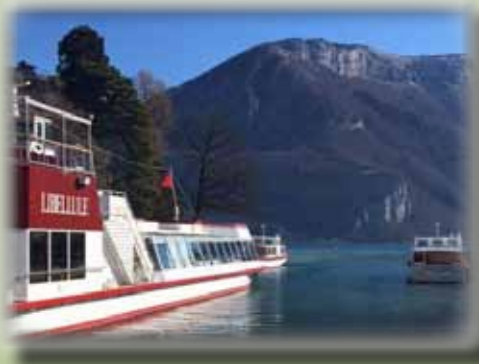
Annecy Boat Tour