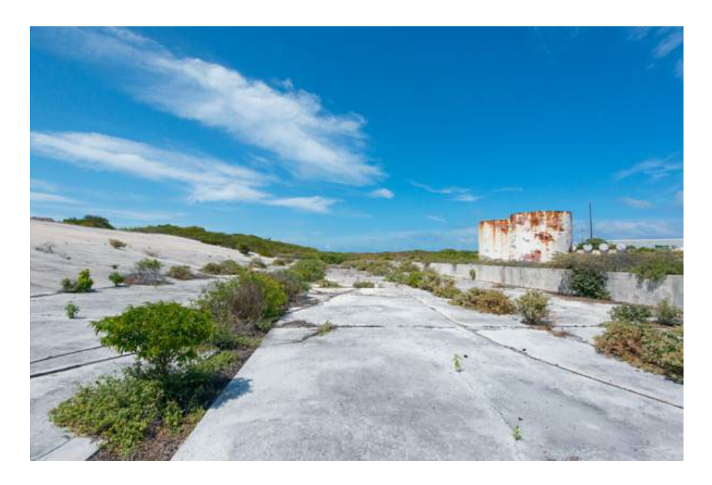
The water catchment area at the abandoned United States Coast Guard LORAN Station, South Caicos.

Over the years, several different ventures were started on South Caicos. Sea sponge farming was tried in the 1930s and was initially somewhat successful, yet a fungus blight disease killed off the sponges and put an end to it. A lobster cannery was also tried. In the 1950s, a Canadian businessman started exporting conch shells to the United States for ornamental purposes. None of these attempts lasted long, and South Caicos has generally experienced a downturn over the last few decades.