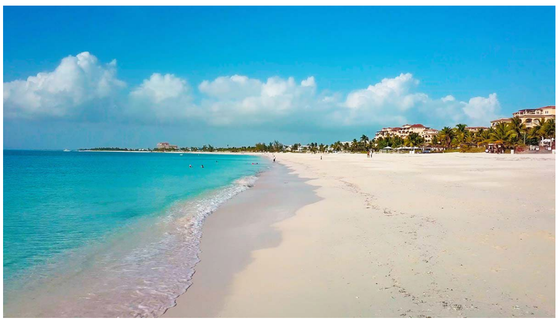
Grace Bay Beach, Provideniales

While Grace Bay Beach is renowned for its powder like sand and crystal clear waters, the island also boasts additional unspoiled beaches worth exploring such as Long Bay, Sapodilla Bay, Blue Hills Beach, Pelican Beach, Taylor Bay, amongst others.