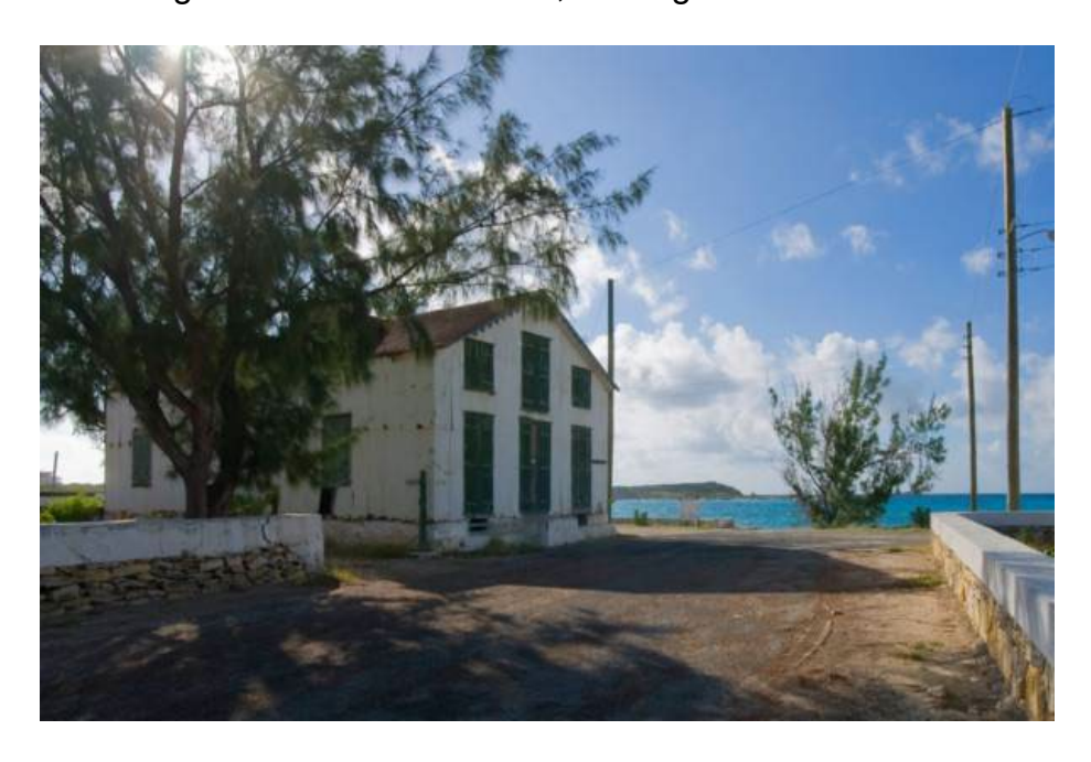
South Caicos has many historical buildings, such as this old warehouse from the days of salt production.

The United States Government also used to have an interest in South Caicos. In 1944, the US established an anti-submarine base on the island, along with the first airstrip in the country. Later, the U.S. Coast Guard constructed a <u>LORAN station</u> on the north end of South Caicos. This site was completed in 1959 and was part of the low-frequency radio signal navigation system that was eventually replaced largely by satellite GPS. Both bases have long been decommissioned, although much of the LORAN station facilities still exist.