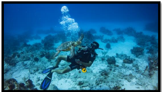
Dive and enjoy the wildlife including turtles