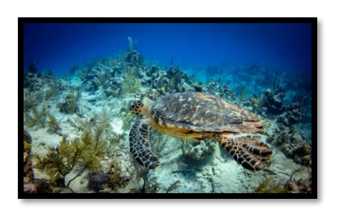
Enjoy the beautiful wildlife