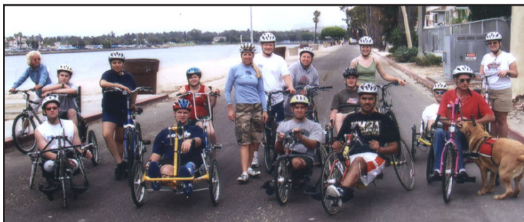
DSUSA Group on a bike outing with ski members.

Don Diego Ski Club has already become involved with the Wounded Warriors of Current Wars. They hosted five wounded veterans for two full ski