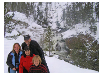
Yellowstone is a must