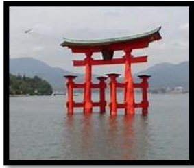
Experience Local Culture