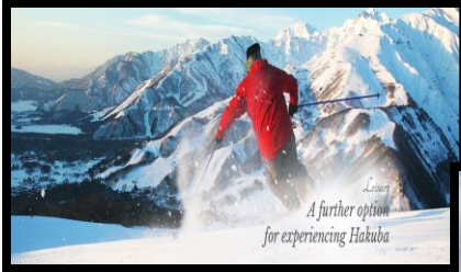
Learn A further option for experiencing Hakuba

Experience the "LAND OF THE RISING SUN". Enjoy the "LAND OF SAKE and CHERRY BLOSSOMS"