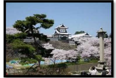
Enjoy Regional Cuisine