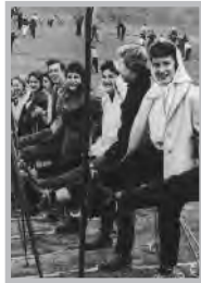
Dry Land Training in So. California

Far West developed a marketing approach, which proved successful in attracting more members. These benefits included dry land training, club and league racing, membership benefits, a newspaper, public affairs programs, insurance, and travel vacation ski weeks.