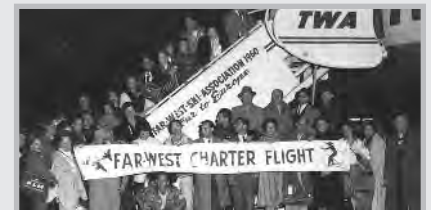
1960 Far West Charter Flight

In 1962, Far West used the proceeds from