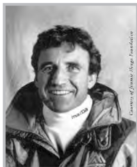
Jimmie Heuga Sept 22, 1943 - Feb 8, 2010

The Jimmie Heuga Award is given to the individual who, like Jimmie, has demonstrated courage and skill in three arenas – the ski slope, the human body, and the courageous heart. ❁