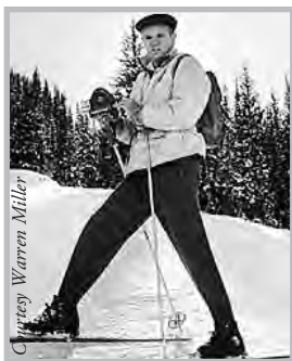
Warren Miller 1924 -

The Warren Miller Award is for Modern Media Coverage of Skiing. This award is given for outstanding service to skiing by cinematographers, photographers, radio or television broadcasters. ❁