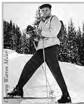
Warren Miller 1924 -

The Warren Miller Award is for Modern Media Coverage of Skiing. This award is given for outstanding service to skiing by cinematographers, photographers, radio or television broadcasters. ❄️